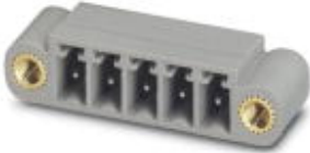
The figure shows the 5-pos. version of the product in gray

Header, Nominal current: 8 A, Rated voltage (III/2): 160 V, Number of positions: 12, Pitch: 3.81 mm, Color: pastel green, Contact surface: Tin, Mounting: Soldering