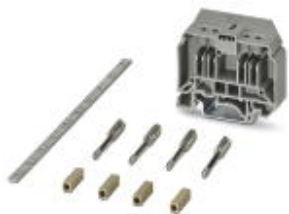
Short-circuit kit for current transformer. Use with DIN rail mounted RBO/RSC 5 feed-through terminals

Please be informed that the data shown in this PDF Document is generated from our Online Catalog. Please find the complete data in the user's documentation. Our General Terms of Use for Downloads are valid ( http://phoenixcontact.com/download )