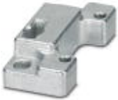
Panel mounting flange for HEAVYCON ADVANCE TMB housing with bayonet locking