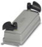
HEAVYCON ADVANCE IP65 protective cover B16, with bayonet locking, with retaining cord, diameter of retaining cord eyelet 3 mm

Protective covers - HC-B 16-TMB-SD-IP65 - 1690956